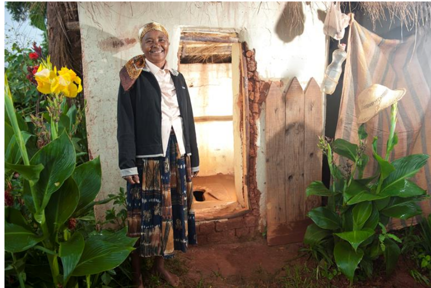
WaterAid © Rindra Ramasomanana

At least half of child under nutrition (stunting) can be attributed to faecally-transmitted infections. In consequence, water, sanitation and hygiene (WASH) should be much higher on the global development agenda.