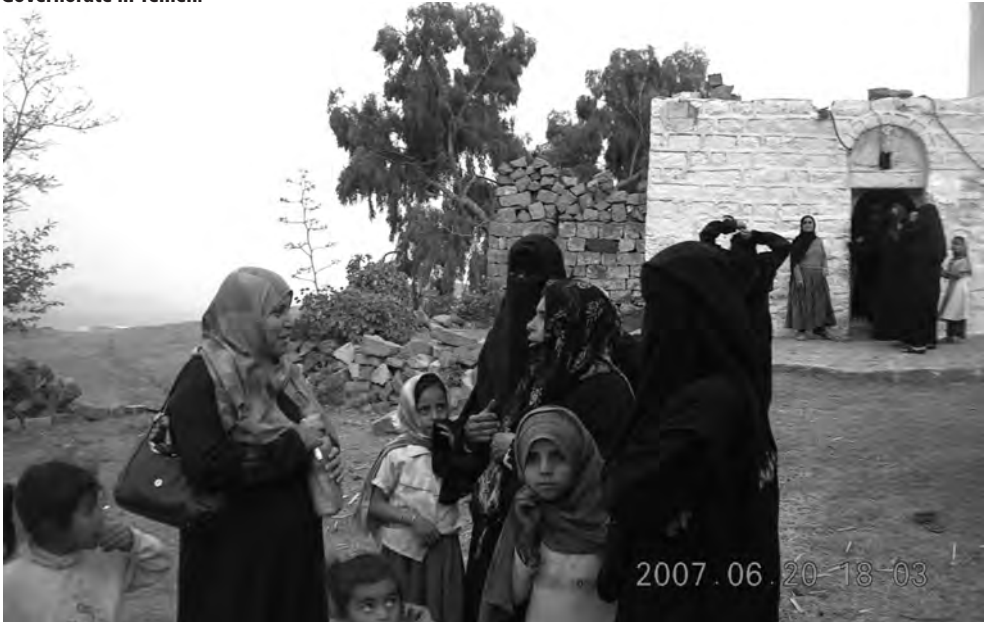
Participation of women facilitators in each CLTS triggering team is essential in Yemen, Pakistan and other Muslim countries. If a conducive environment is ensured and triggering meetings are arranged indoors or in places where no men could see them, women participate spontaneously, express their views and initiate collective actions against open defecation (OD).