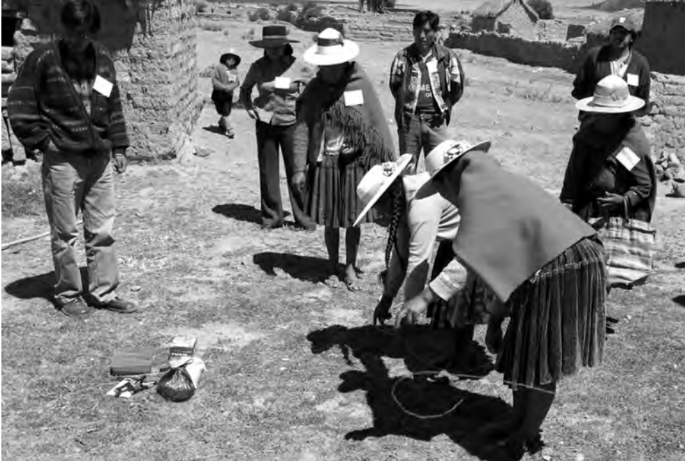
Women in a Bolivian village using woollen thread to draw a village map on the ground and show areas of OD.