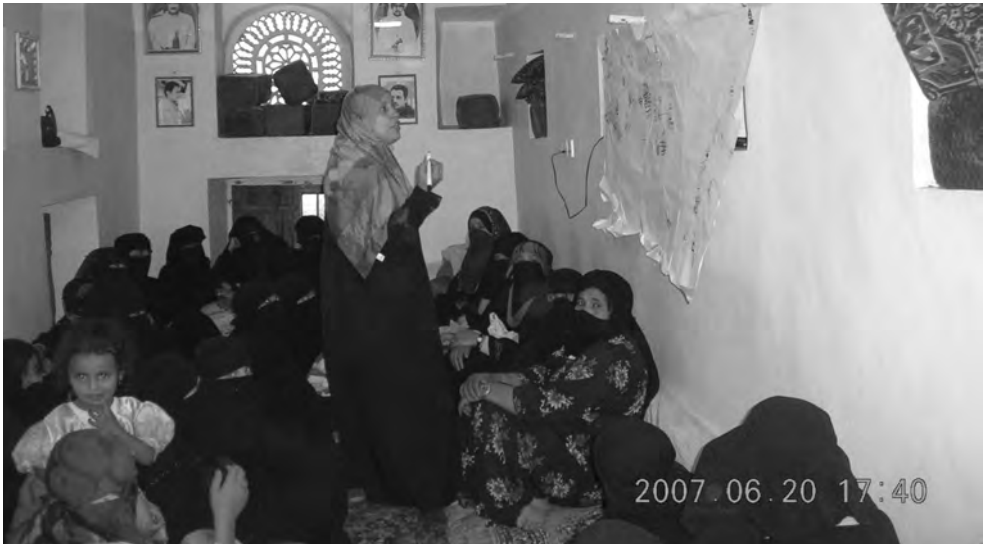
Woman facilitator from Social Fund for Development (SFD) Sana'a, triggering CLTS with village women in Ibb Governorate in Yemen.

Feel free to innovate and try out new methods apart from those described below.