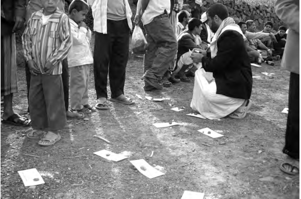
Calculation of household shit production is in progress, in a village in Yemen. Analysing the defecation area map along with the calculation of shit per household and faecal-oral transmission routes together with the community is extremely crucial.

They also benefit most from saving money spent on treatment of diarrhoea and other diseases.