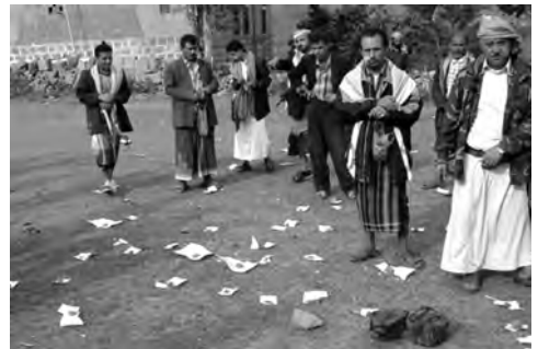
Mapping in progress in a village in Ibb Governorate, Yemen. In a well facilitated CLTS triggering process, many people work on the map together and indicate their households, areas of open defecation and calculate the amount of shit produced by the respective households.