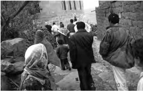
The suitable places for open defecation are identified by the local communities during a defecation area transect. Members of local community of a village in Ibb Governorate in Yemen leading an OD transect team to show potential places frequented by people in the morning and evening.

they smell and do they lick members of the family or play with the children? Once their interest is aroused you can encourage them to call other members of the community together. You will also need to find a place where a large number of people can stand or sit and work.