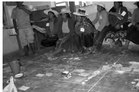
Yellow powder on the map shows defecation areas. As the CLTS triggering process moves on and the community indicates areas of emergency defecation, yellow patches on the map spread and increase. Anxious members of a community look on in a village in Bolivia. Be alert for capturing spontaneous comments of disgust and individuals wanting to stop all these.