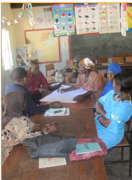
Above: Traditional Authorities brainstorming ideas on why previous sanitation projects have failed

Some of these activities included setting a specific date for follow-ups in their villages once