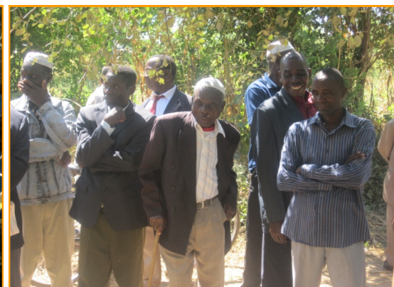
Traditional leaders reacting with disgust, shame and laughter at the demonstration.