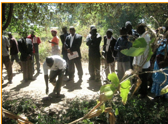
The training was opened with a Shit & Food demonstration to trigger the traditional leaders. Shit was found near the training venue, and fish was cooked beside the shit. They watched as flies moved back and forth between the shit and the fish.

The training was deemed a success by both the district staff who conducted the training and the participating traditional leaders. At the end of it, the traditional leaders had generated a list of roles which they will play in each step of the CLTS process. Each TA also created action plans based on their learning which they will implement upon returning to their communities.