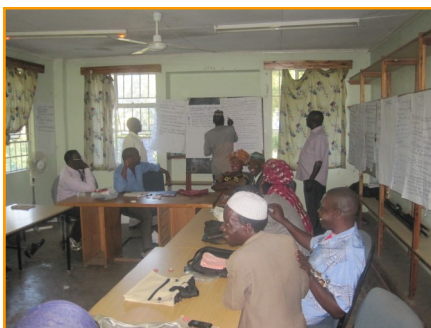
Above: Traditional leaders listening to a presentation of a TA action plan and providing feedback