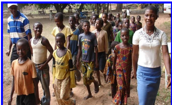
Processions of Children in Watuola community, Ado LGA of Benue State chanting slogans on stop open defaecation !!!