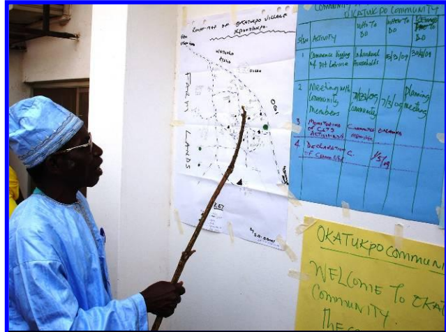
Presentation of Action Plan by a Community member during the workshop

The following communities presented their action plans at the workshop;