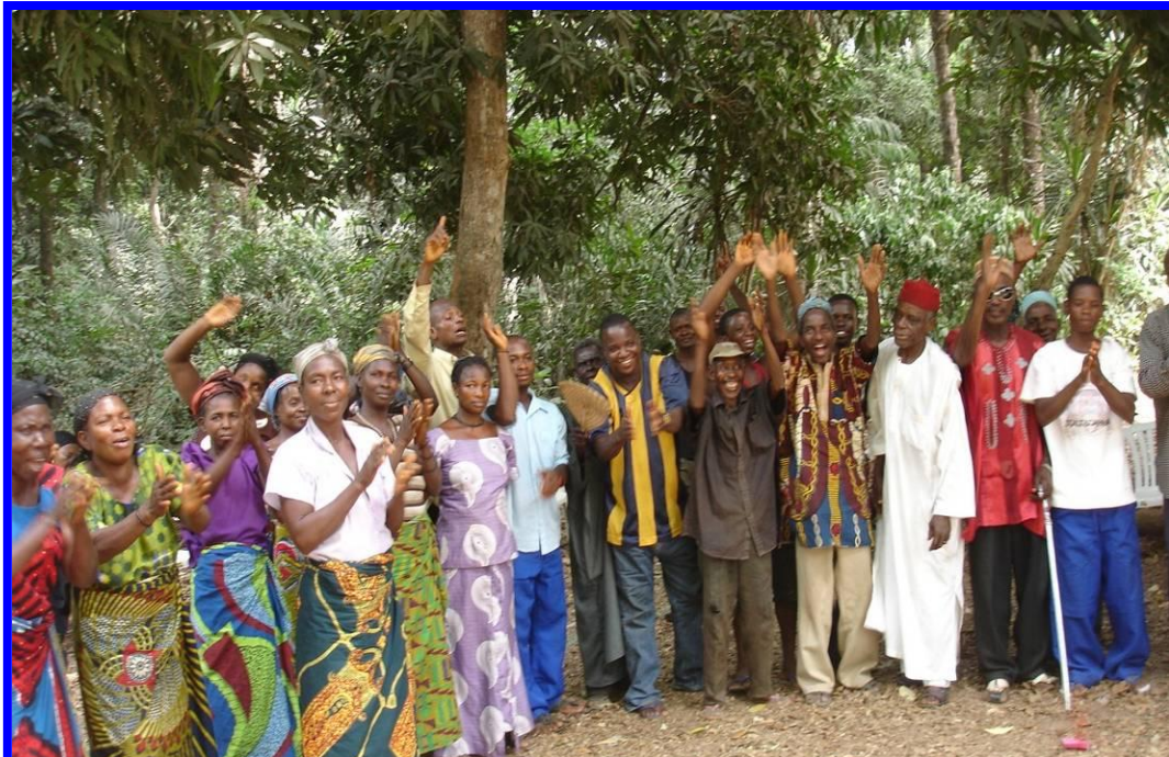
Members of Watuola community agreeing to stop open defaecation during the triggering exercise

There were group presentations on the triggering exercise based on the following format;