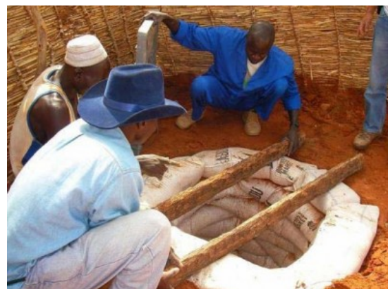
Sandbag latrine lining, Oxfam, South Sudan

One of the challenges for sustainability of ODF can be difficult physical conditions that make the latrines built by communities collapse after a short time or make it hard to dig pits in the first place. Such conditions include flood-prone areas, sandy soil or hard rock. But we also know that there are ways and technological innovations that communities and CLTS practitioners have found to tackle these issues. We would like to hear from you